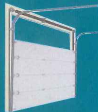
Standard or High Lift Doors