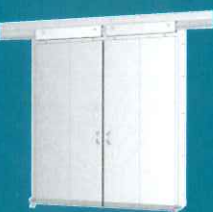
Bi-Parting Sliding Doors