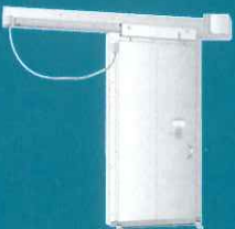
Single Sliding Doors